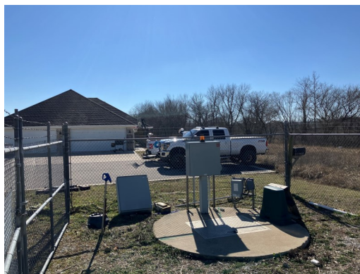
Left: Prairie Meadows Pump Station