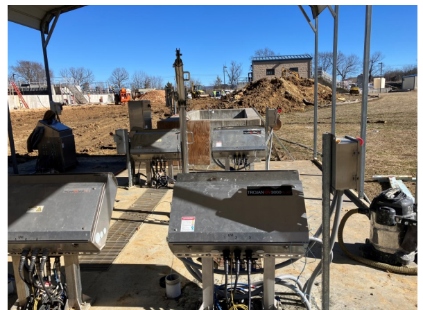
Bottom, the new UV equipment and light installation