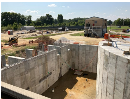
Top: The anoxic zone of the new bio unit #3

Other construction has included work on the new chem building, near completion of a new splitter box, and installation of the 3rd screw pump- Work remains on the UV System, electrical work, installation of chemical feed systems, and electrical control installations.